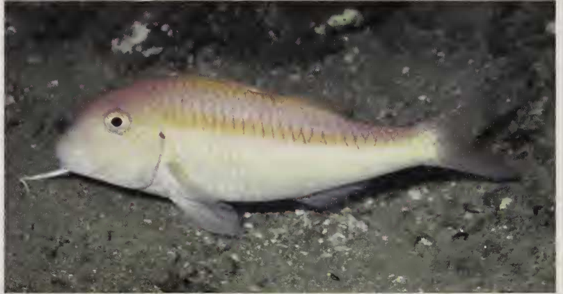
Fig. 4. Parupeneus fraserorum , KwaZulu-Natal.